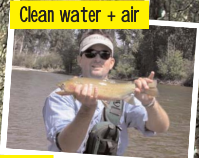
Clean water + air